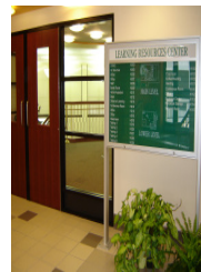
Entrance of the new Gordon P. Allen Learning Resources

The new building will provide more space, more computers, and more services. The LRC staff believes that the College community will enjoy the new LRC facility. Our new services include a Business Center,