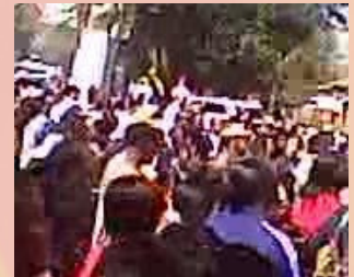
People standing at Brown Chapel AME Church before marching to the Edmund Pettus Bridge

Before this trip to Selma, I did not care a lot about voting, but while in Selma, I really got a chance to see the true meaning behind the importance of voting, and it changed my life. My perspective changed how I started to see things. Now, I know that if I do not