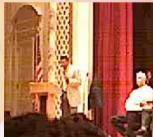
Judge Greg Mathis speaking at the Hip Hop panel

This leadership experience is one that has made voting a real issue for me, and I have committed myself to getting involved at a higher level in student government. I now serve as the Caswell Representative in Student Government.